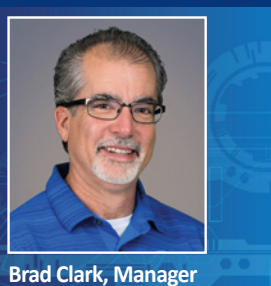
Research & Development